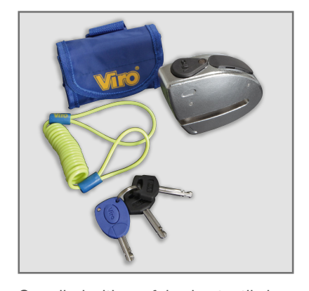
Supplied with useful nylon textile bag and "reminder" cable to avoid starting with the disc lock inserted. Lock protected by weatherproof cap

Innovative and original design, very sturdy, particularly suitable for motorbikes