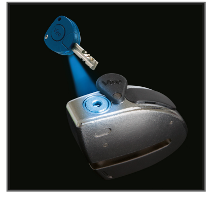
Key with useful blue light integrated