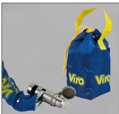
Supplied in useful nylon textile bag. Key hub protected by weatherproof cap