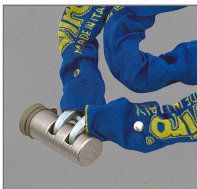
Semi-squared chain cut Ø 10 mm, made of tempered and zinc plated manganese steel, protected by blue textile cover to minimize the space occupied when stored