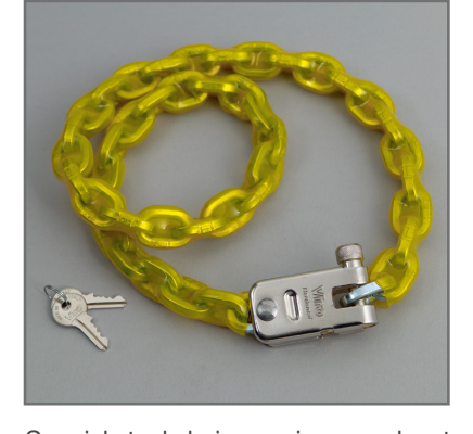
Special steel chain, semi-squared, cut Ø 5.5 mm, fixed to "Morso" padlock by inox stainless steel riveted pin and protected by yellow plastic cover