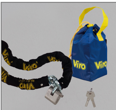
Supplied in useful nylon textile bag