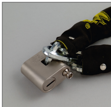
Hexagonal chain, cut Ø 13 mm, made of special casehardened, tempered and zinc plated manganese steel, protected by black textile cover to minimize the space occupied when stored