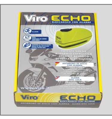
Elegant visual packaging summarizing product main technical and operational features. It can be hanged vertically by means of the apposite buttonhole