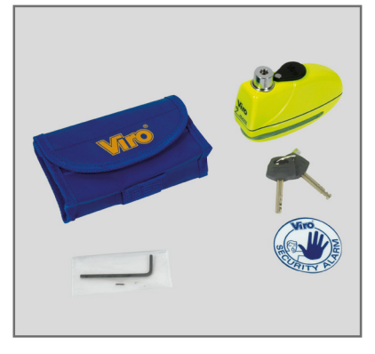
Supplied with a useful nylon textile bag containing: Allen key for battery replacement, user instructions and keys. Weather-proof lock

Advanced and reliable, recommended for locking scooters and motorbikes