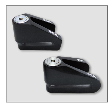
One-piece case-hardened, tempered and black painted steel body