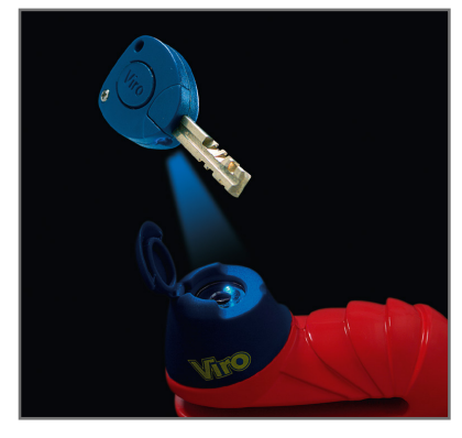
Key with useful blue light integrated