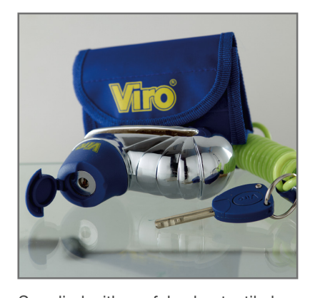
Supplied with useful nylon textile bag and "reminder" cable in order to avoid starting with the disc lock inserted. Lock protected by weatherproof cap