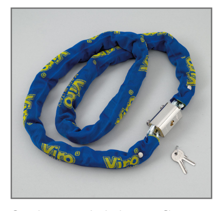
Semi-squared chain, cut Ø 8 mm, made of special casehardened and tempered manganese steel, protected by blue textile cover to minimize the space occupied when stored