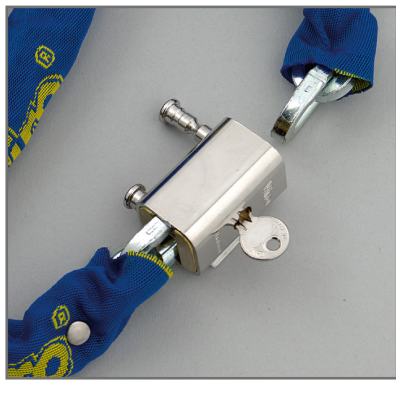
Two independent dead-bolts and pull-resistant plug

Very secure and sturdy; particularly suitable for locking scooters and motorbikes