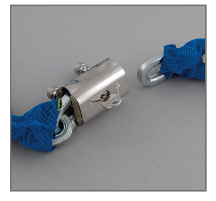
Semi-squared chain, cut Ø 10 mm, made of special casehardened and tempered manganese steel, protected by blue textile cover to minimize the space occupied when stored