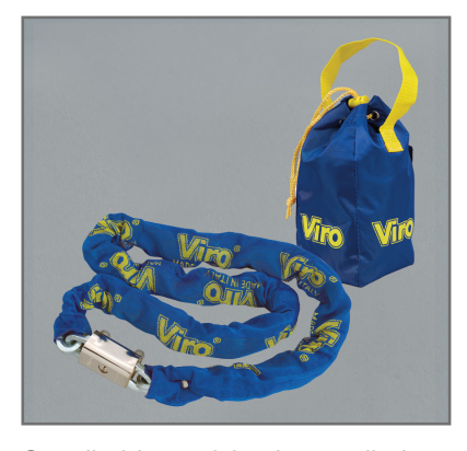
Supplied in useful nylon textile bag. Pull and drill-resistant plug