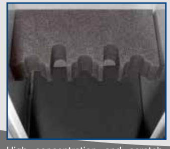
concentration and ethylene gun ed in thickn provides the perfect setting of single or double-barreled rifle ven with optical)