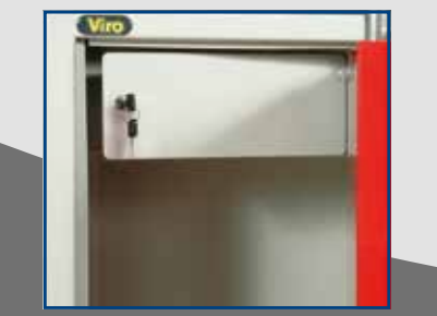
Safety box for ammunitions/objects equipped with a Fai by Viro lock, supplied with 2 keys