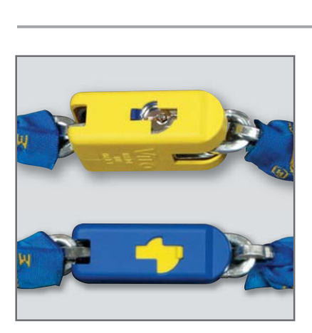
Pull and drill-resistant plug. Lock protected by weather-proof cap