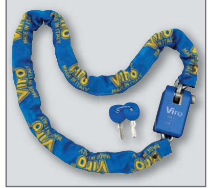
Manganese special steel semi-squared chain, cut Ø 7 mm., fixed to "Supermorso" padlock by inox stainless steel riveted pin and protected by blue textile cover to minimize the space occupied when stored