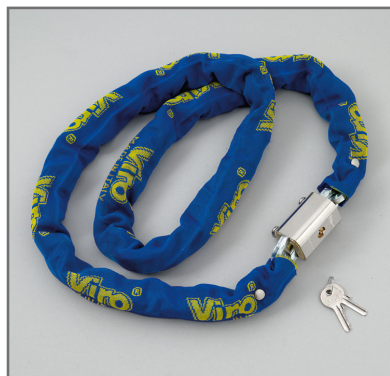
Semi-squared chain, cut Ø 8 mm, made of special casehardened and tempered manganese steel, protected by blue textile cover to minimize the space occupied when stored