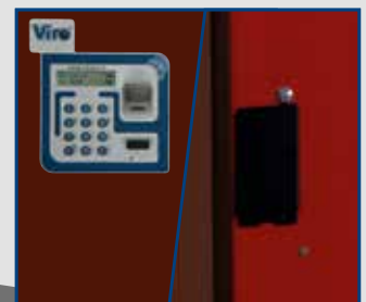
Sound/visual signals and a pleasant label with instructions on front door guide the user. Low consumption electronic board. Internal power supply (4 alkaline 1.5V batteries). Display and sound signal of almost empty batteries. Non-volatile memory: the recorded fingerprints, codes and data in archive are not erased when power supply is removed